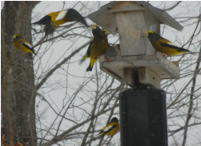
Evening Grosbeaks

Thank you, everybody, for all that you have done for the Discovery Center Bird Club during 2011. I have thoroughly enjoyed our outings and your company, and I am looking forward to seeing everybody frequently during 2012!