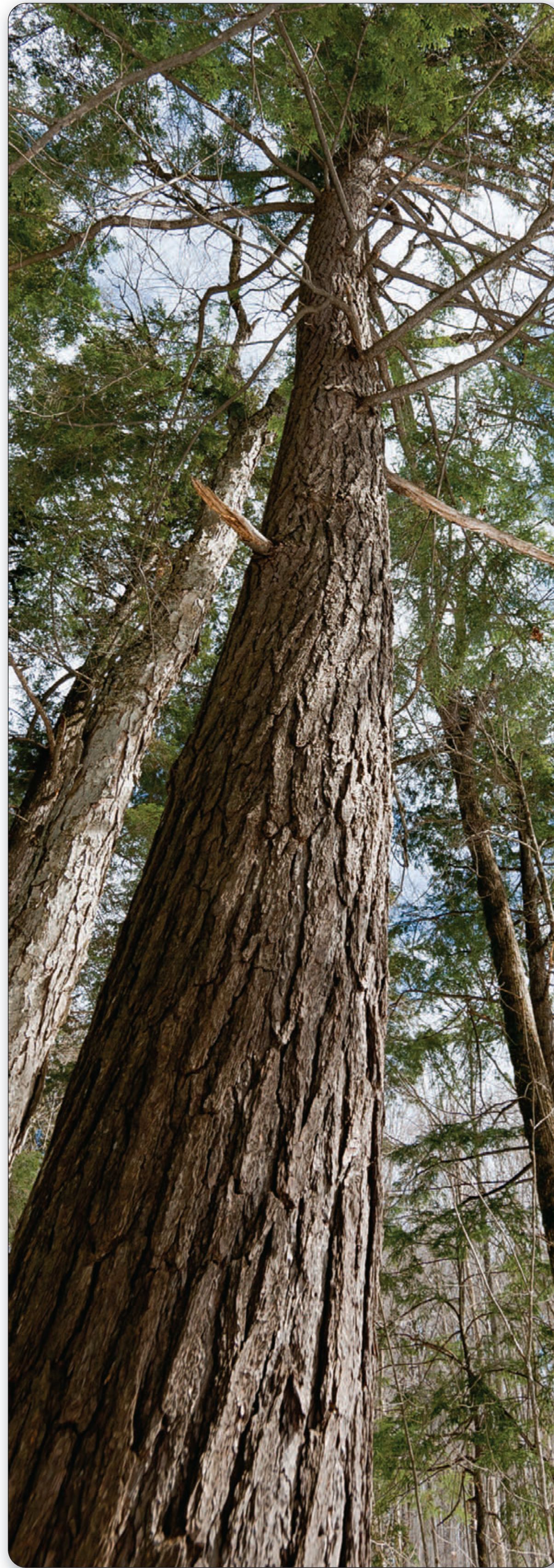
Hemlock

The 416 acre tract of land you are about to enjoy has been available for public use and recreation since Wisconsin gained statehood in 1848.