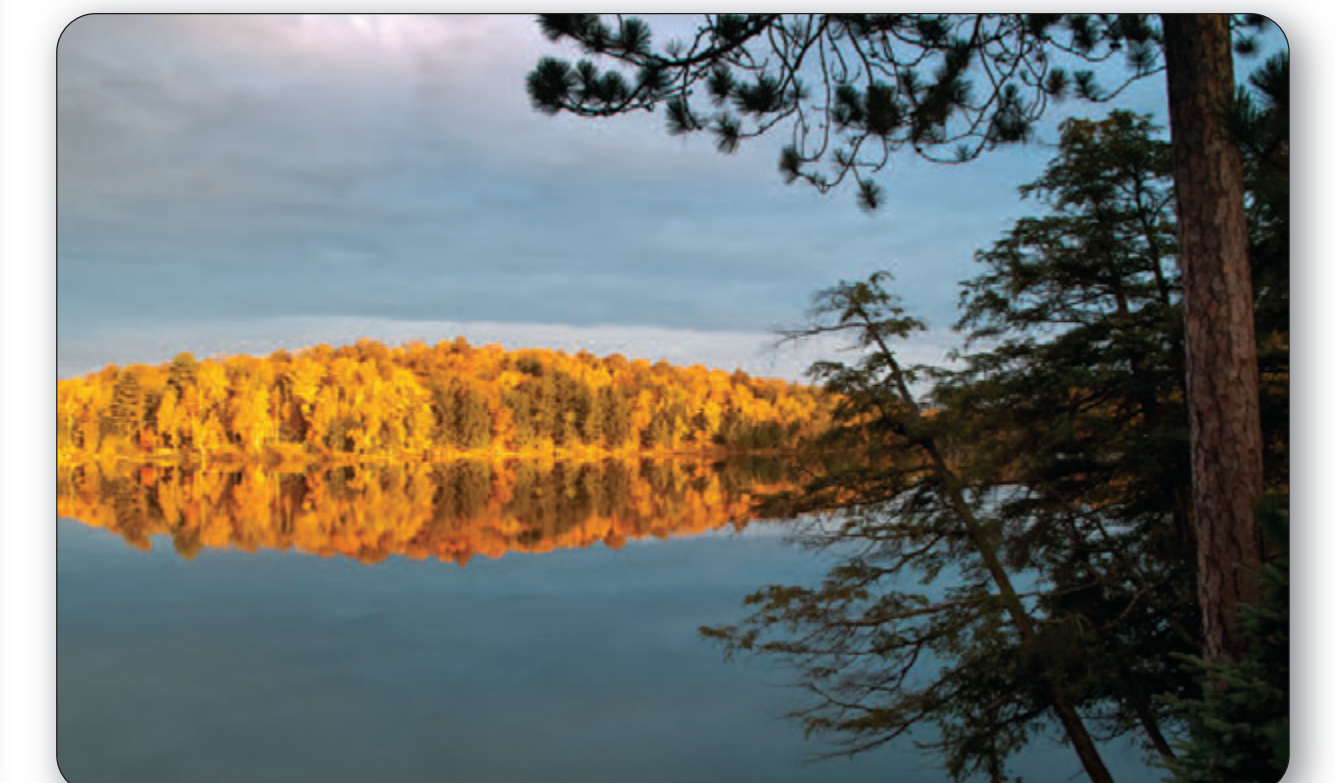
Unspoiled shoreline of Van Vliet Hemlocks.

The principal of the Common School Fund is invested in loans to school districts and municipalities for public purpose projects through the BCPL State Trust Fund Loan Program, helping communities in every corner of the state.