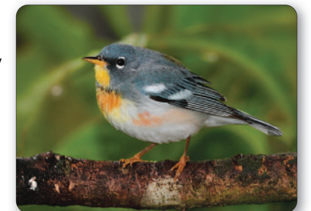
Northern Parula Warbler

While the Board of Commissioners of Public Lands, consisting of the Secretary of State, the State Treasurer and the Attorney General, was created more than 150 years ago, the duties and fiduciary responsibilities remain the same – managing Wisconsin's Trust Assets for public education.